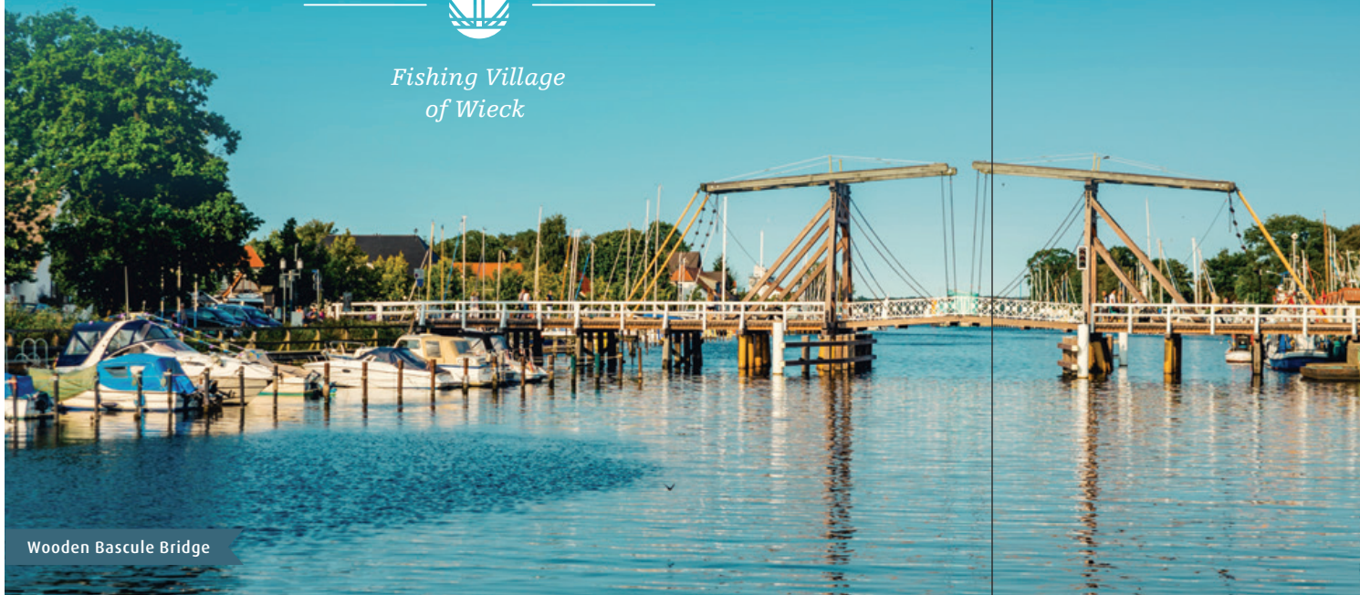
Wooden Bascule Bridge