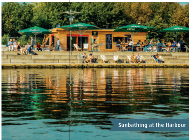
Sunbathing at the Harbour