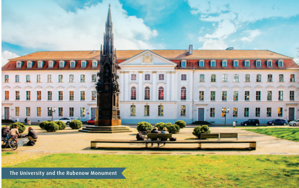
The University and the Rubenow Monument