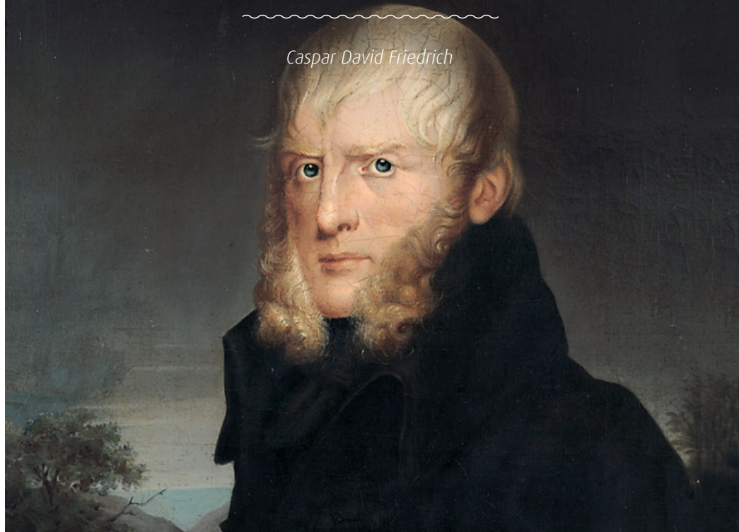
Caspar David Friedrich